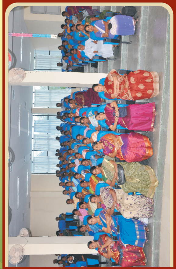
Participants at the Mother's Day Celebration