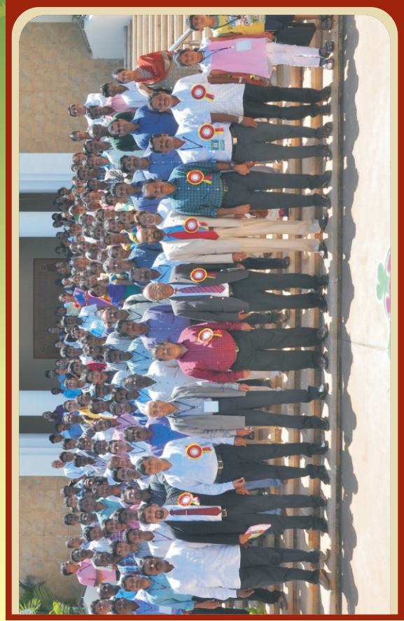
Participants at the 7 th National Seminar cum Workshop on "Recent Trends in Structural Bioinformatics and Computer Aided Drug Design " SBCADD-2015