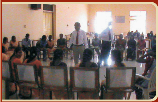
Experts from Integrated Enterprises India Pvt. Ltd conducting Group Discussion