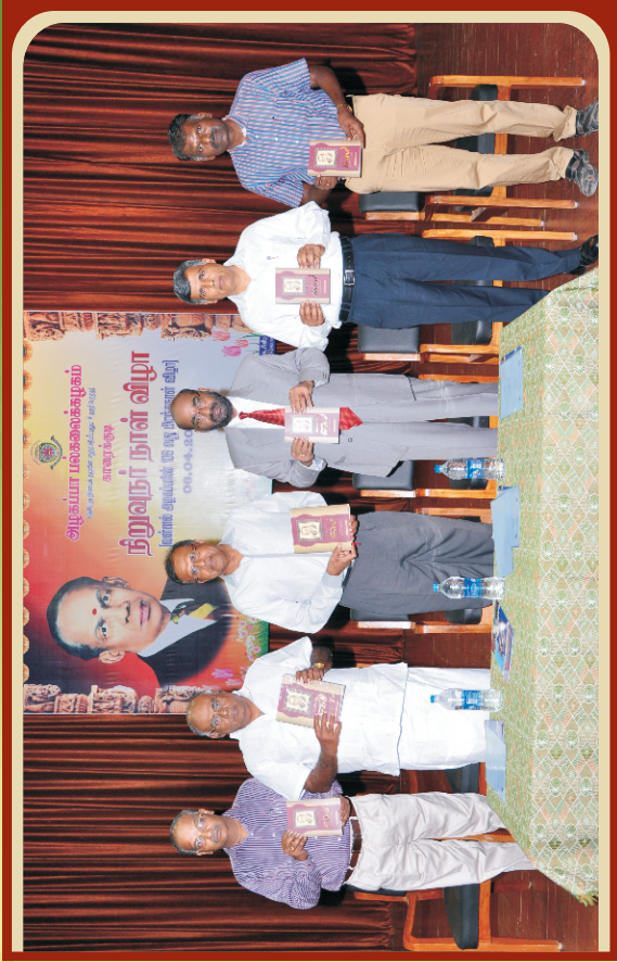
106 th Founder's Day Celebrations