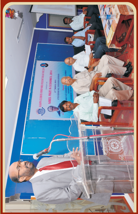
Seminar on Nobel Prize in Economics, 2014