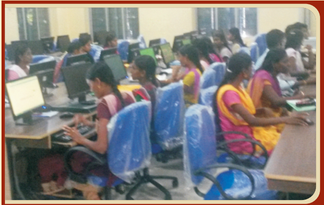
Students attending Online Test at the Computer Laboratory for the selection of ICICI BANK Sales Officer Post